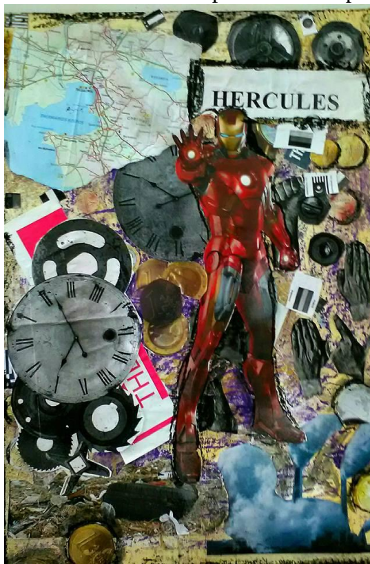
2 a hero and his labours in the present