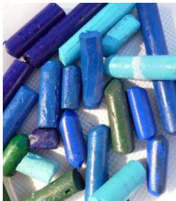
1 cold shades