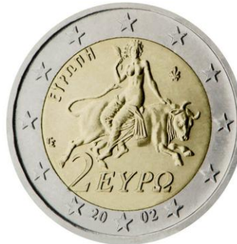
Euro-crises in Greece