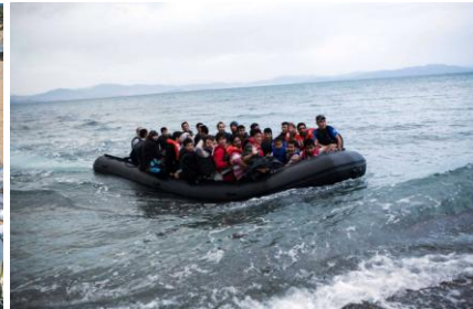
refugees near the island of Kos

SOURCES for imagery for the two collages: look separate sheet